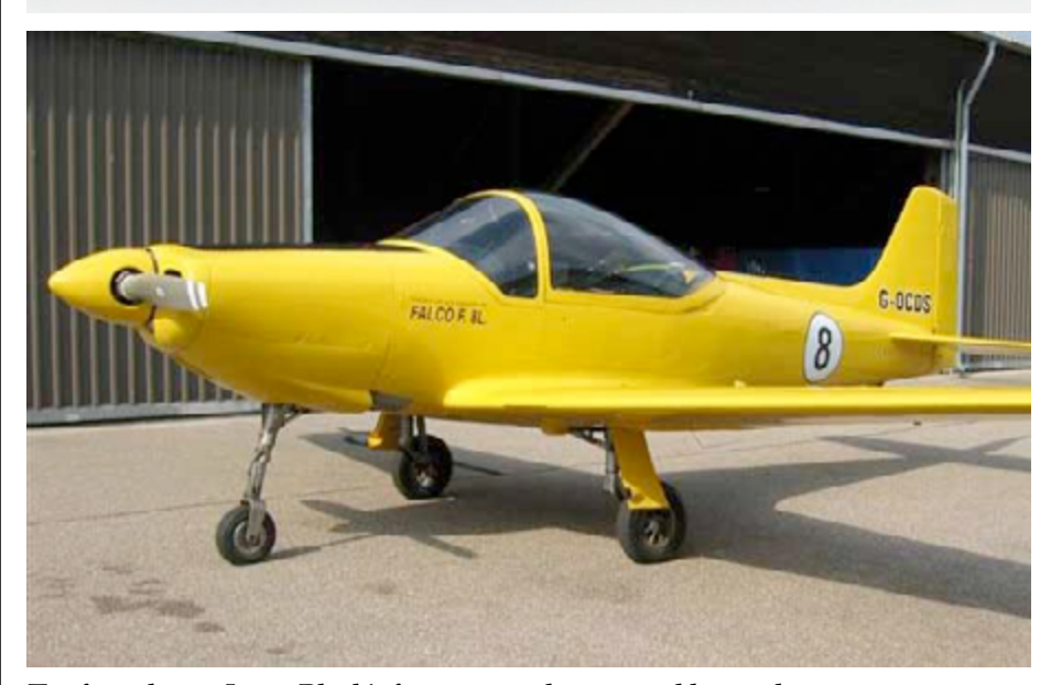
Top four photos: Larry Black's fairings gave him a sizeable speed increase.

just go to the next largest wire size and use the appropriate circuit breaker to match the wire. Remember, the purpose of the circuit breaker is to prevent a fire in the event the wire over-