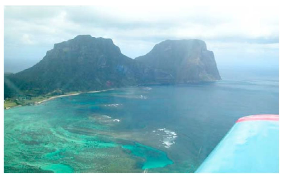
Top: Lord Howe, Ball's pyramid and Admiralty Islands. Center: With luggage at Lord Howe. Above: Mts. Lidgbird and Gower.

not high, but are very rugged. I would prefer to land in the water any time. It was many years after settlement before explorers were able to cross them to the inland plains. Soon we were landing at Taree and preparing for a reasonably early start in the morning.