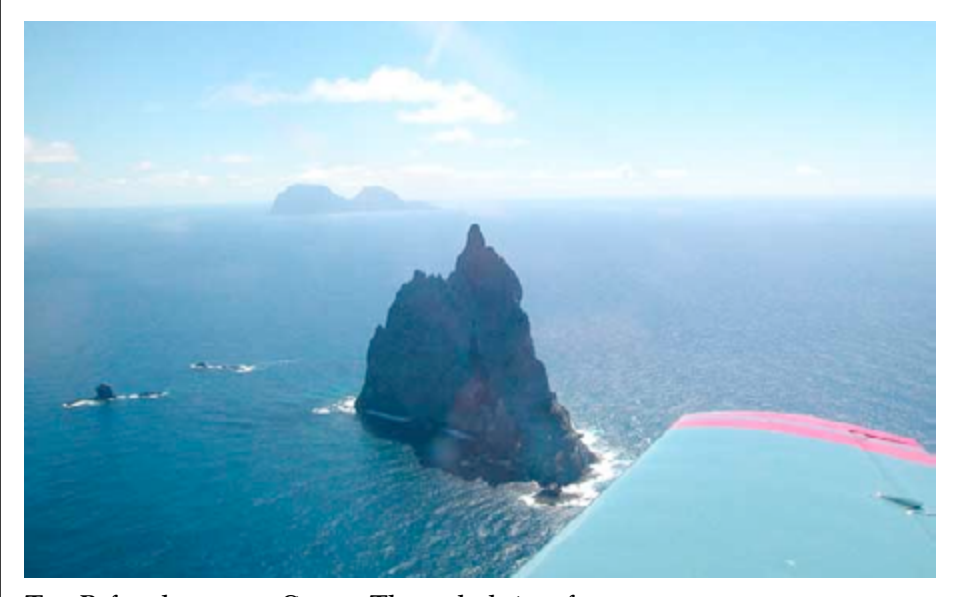
Top: Before departure. Center: The packed aircraft. Above: Ball's pyramid and Lord Howe.