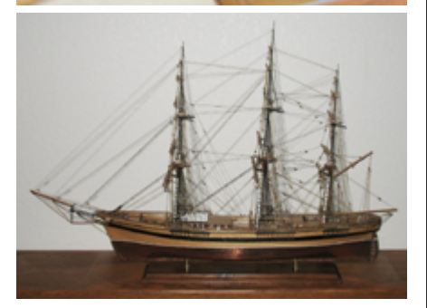
Two SF.260s spotted in the wild. Above: Dean Hall's model ships.