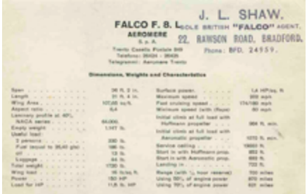
Top and above: Front and back of 1960's postcard of Aeromere Falcos. Left: How much spruce does it take to build a Falco?