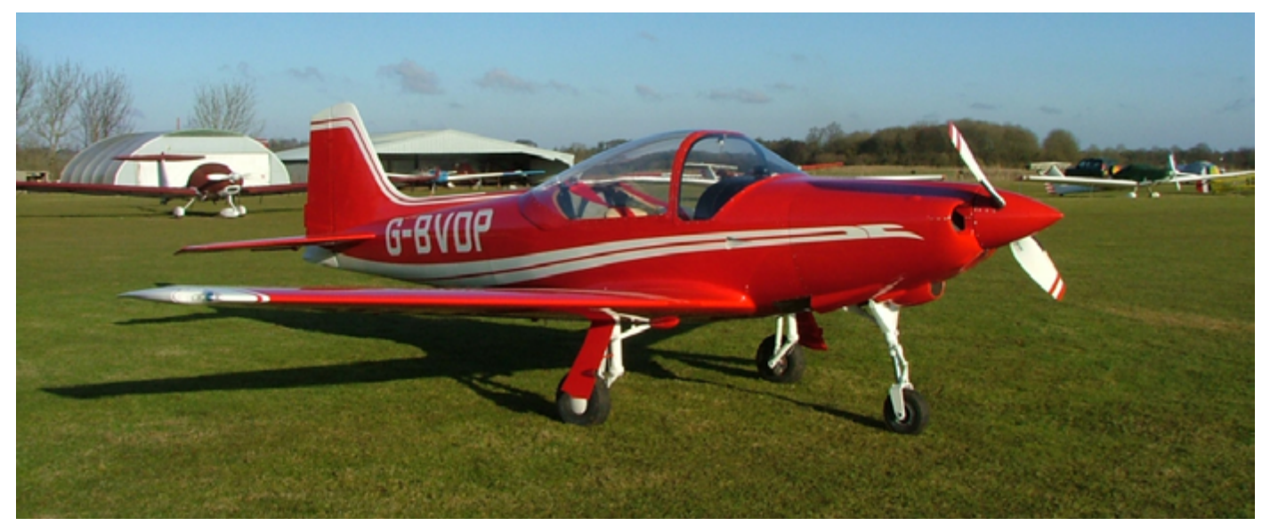
Nick Turner has recently repainted G-BVDP. The Falco is based at Biggin Hill (EGKB), England. Below: No one was hurt when this Falco crashed in Palermo, Italy. Opposite page: Bjørn Brekke's Falco takes shape in Norway.

ence between the ribs and the tight line and a piece of 2mm plywood can be used to gauge the hight of the rib. The leading edge of the ribs must be sanded to the correct angle to accept the leading edge.