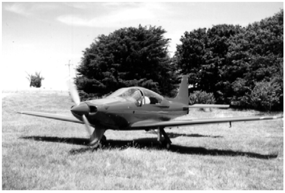
Stephen Friend prepares to inspect the sheep.

I have tapered both rear spars in plan form, so I can safely order hardware to build the flaps and ailerons next. While waiting for delivery, I should finish No. 1 and 2 wing ribs. (I built all ribs with a CAD program mylar templates. What a joy. Nice to have a Hewlett Packard friend.) It's very enjoyable to work on the ribs. The flap and aileron spars are a piece of cake. Forward wing spar is laid out on the bench.