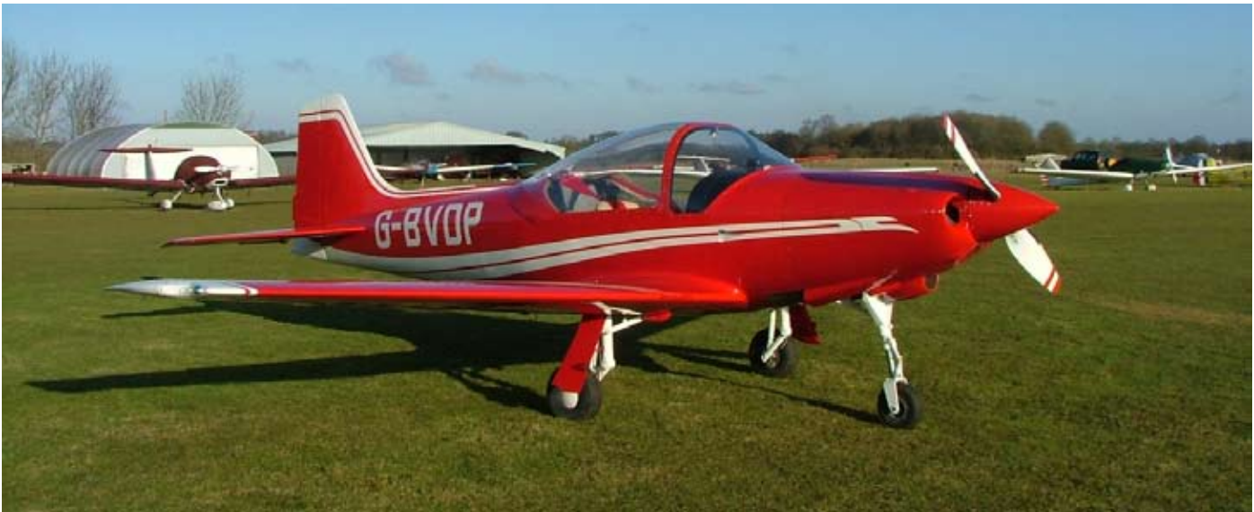
Nick Turner has recently repainted G-BVDP. The Falco is based at Biggin Hill (EGKB), England. Below: No one was hurt when this Falco crashed in Palermo, Italy. Opposite page: Bjørn Brekke's Falco takes shape in Norway.

ence between the ribs and the tight line and a piece of 2mm plywood can be used to gauge the height of the rib. The leading edge of the ribs must be sanded to the correct angle to accept the leading edge.