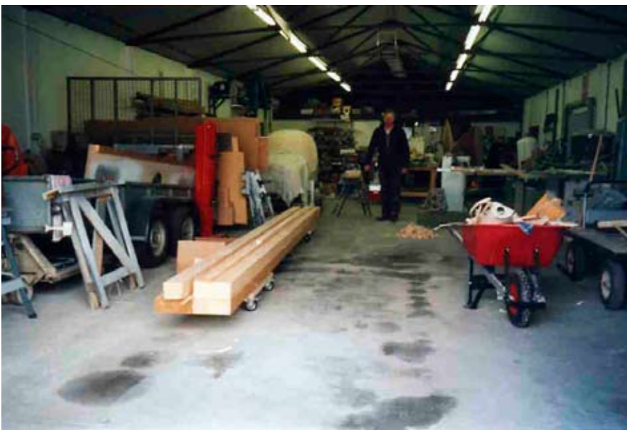
Top and above: Front and back of 1960's postcard of Aeromere Falcos. Left: How much spruce does it take to build a Falco?