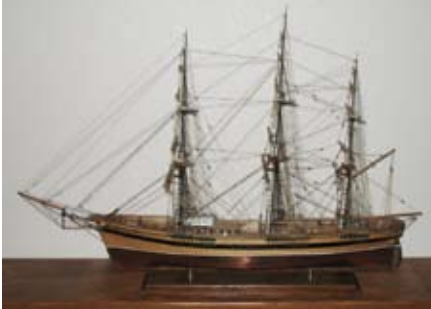
Two SF.260s spotted in the wild. Above: Dean Hall's model ships.